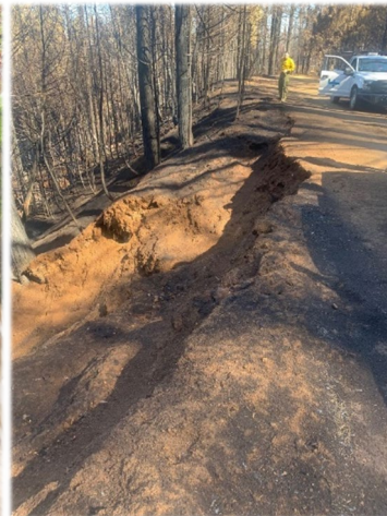
Road Bank Failure