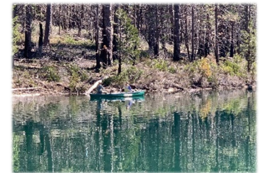
Bathymetric Survey Crew

Stumpy Meadows Reservoir was recorded at capacity between February and May.