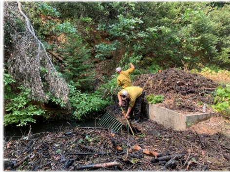
Debris Removal from Canal