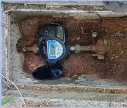
New Smart Meter

Auburn Lake Trails Wastewater Services – During the 2022 reporting period, a total of approximately 906 annual and 71 escrow inspections were performed in the Auburn Lake Trails Wastewater Disposal Zone. In order to reduce inflow and infiltration into the Community Disposal System (CDS) a total of ten tanks were watertight tested for inflow and infiltration. Three tanks failed the watertight test and have been replaced.