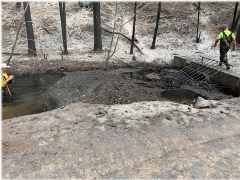
Debris Removal from Canal