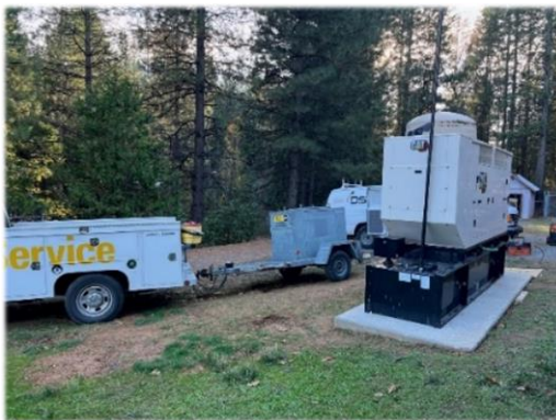
Walton Lake Treatment Plant Generator

During the 2021 calendar year, the District continued to make key upgrades to the District's infrastructure to ensure the delivery of high-quality drinking water to residents of the Georgetown Divide communities. Key projects completed include: