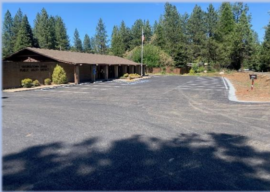
Repaved Parking Lot -Front of Office

Auburn Lake Trails Wastewater Services – During the 2021 reporting period, a total of approximately 1,307 annual and 86 escrow inspections were performed in the Auburn Lake Trails Wastewater Disposal Zone. In order to reduce inflow and infiltration into the Community Disposal System a total of four tanks were watertight tested and two manholes were coated.