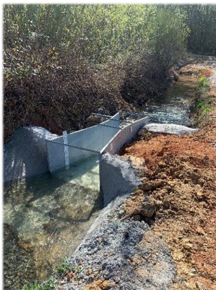
Main Ditch Gaging Station