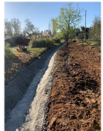
Lined Section of Canal