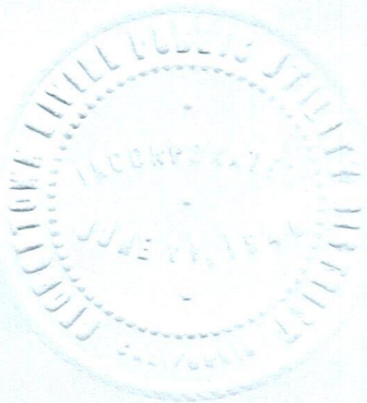
Exhibit A – Policy 5030 – Water Transfer Policy