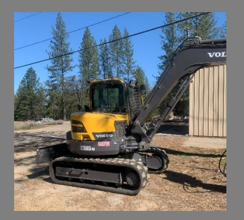
Grant funded mini excavator

GDPUD "Fire Safe on the Divide" Project Underway to Protect Our Communities