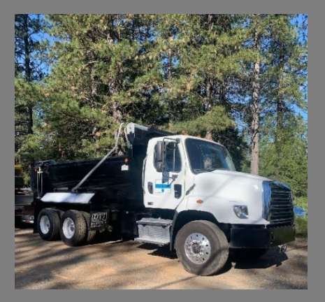
Surplus/CIP Funded Dump Truck